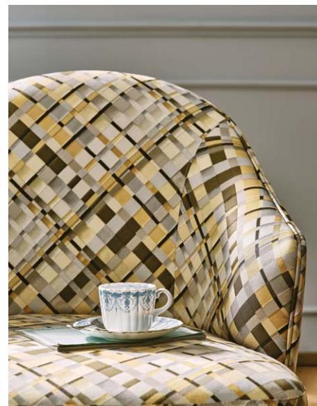
Rubelli's Saint Etienne fabric is festooned with diagonal ribbons

佈置家居時，我們多會考慮美感與實用。然而，兩者並不互相衝突。如能好好結合兩者，更可令家居變得更美觀及舒適怡人。在偌大的家居，牆壁是最大的佈置空間，更是我們展示品味的好地方。此外，我們亦可以選擇色彩斑斕的家具或擺設，為家居多添生氣。