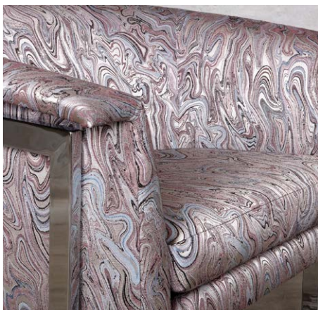
Pollack's Ebru fabric can be used in both conservative settings and trendy occasions

This unique pattern can be used in more conservative settings, but is equally suitable for more trendy occasions.