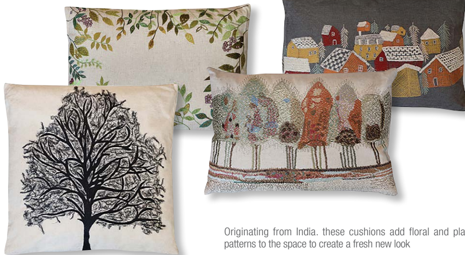
Originating from India, these cushions add floral and plant patterns to the space to create a fresh new look

Finally, consider adding an embroidered cushion to your home. TREE's cushions originate from India and are carefully woven by artisans, adding floral and plant patterns to the space to create a fresh new look. The cushions are available in a variety of designs, including autumnal trees reflecting the transformation of green foliage to shady lattice branches, adding a natural touch to interior spaces.