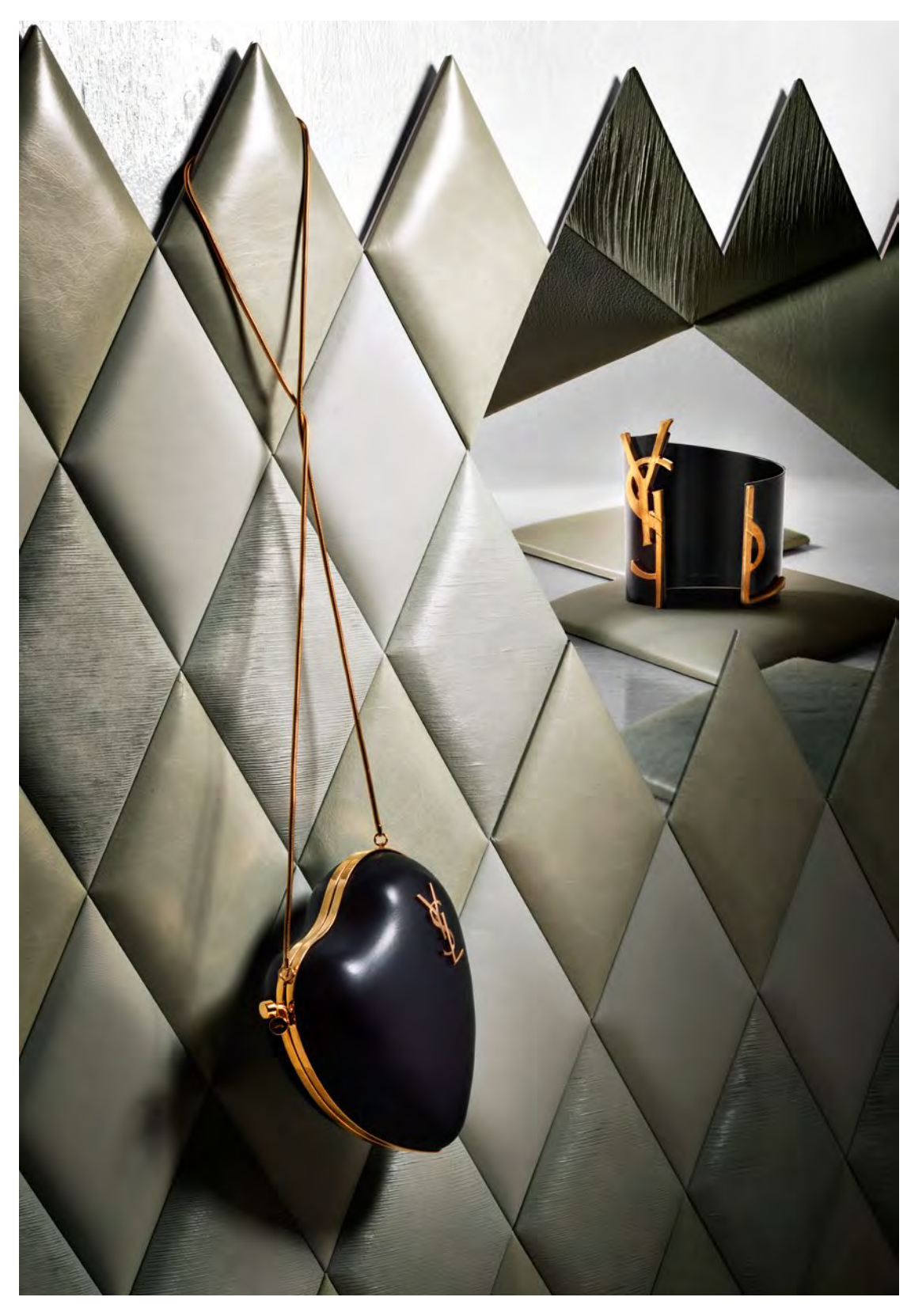
Love Box in leather and gold-tone hardware and Monogram Deconstructed Logo cuff in black ruthenium and aged gold-tone brass, SAINT LAURENT BY ANTHONY VACCARELLO. Losange leather tiles in Mushroom Geyser, Polis Perla Akoya and Lumiere Geyser, STUDIOART at Tatum Singapore.