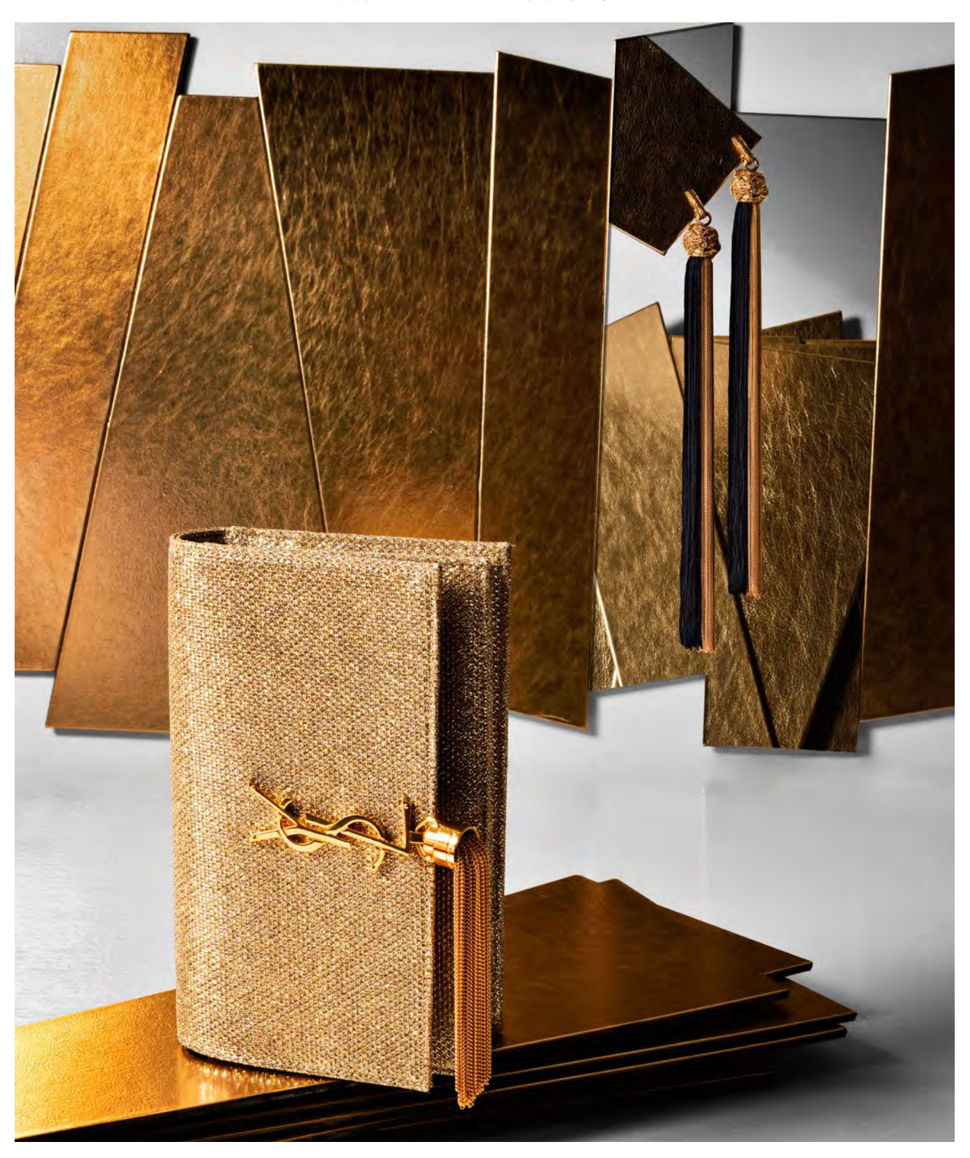
Kate Monogram tassel chain wallet in glitter fabric and Loulou clip earrings with viscose and brass chain tassel, SAINT LAURENT BY ANTHONY VACCARELLO. Frammenti Tesoro leather tiles in Oro, STUDIOART at Tatum Singapore.